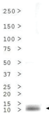
Figure 2. Western Blot

Immunofluorescence of H4R3me1 antibody. Tissue: Nonmitotic, prophase, and telophase HeLa cells. Fixation: 0.5% PFA. Primary antibody used at a 1:50 dilution for 1 h at RT. Secondary antibody: FITC secondary antibody at 1:10,000 for 45 min at RT. Localization: Histone H4R3me1 is nuclear and chromosomal. Staining: Histone H4R3me1 is expressed in green, nuclei are counterstained with DAPI (blue).